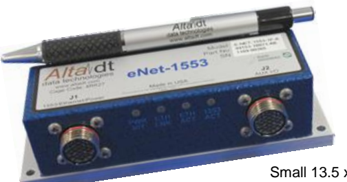
Small 13.5 x 3.7 x 4 cm 200 grams Rugged MIL 810G Tested